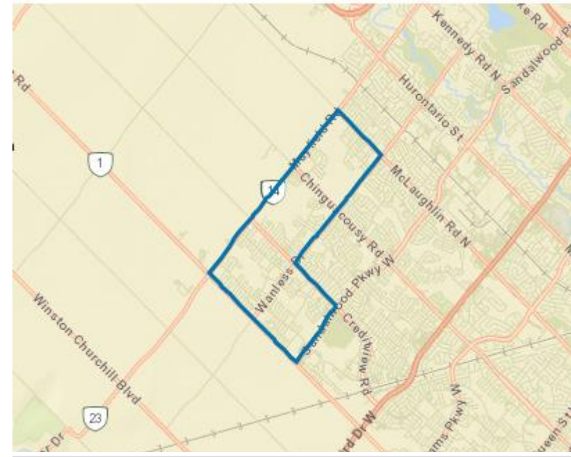
Brampton (census tract 0576.98)